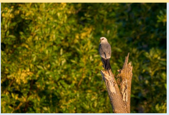
Mississippi Kite