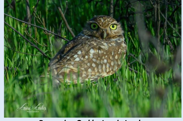
Burrowing Owl by Laurie Lawler