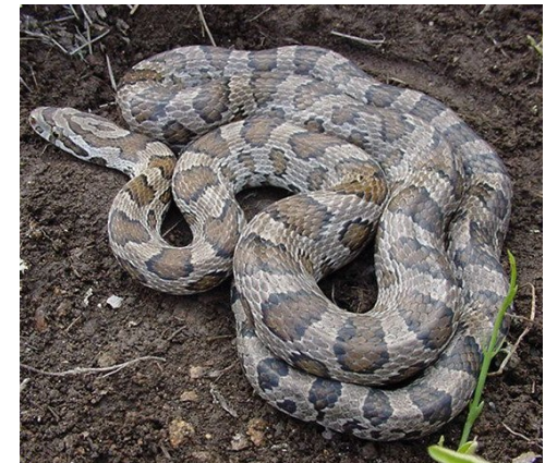
Great Plains Rat Snake