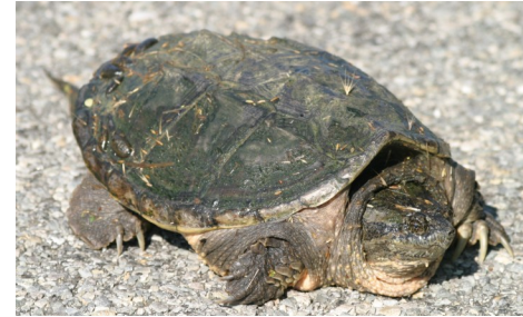
Snapping Turtle (Potentially Dangerous)