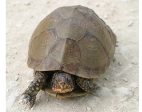
Three-toed Box Turtle