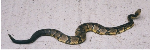
Timber Rattle Snake (Potentially Dangerous)