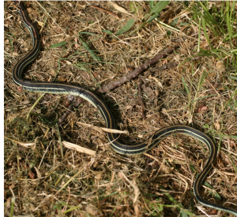
Western Ribbon Snake