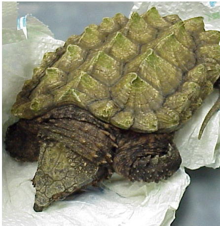
Alligator Snapper (Potentially Dangerous)