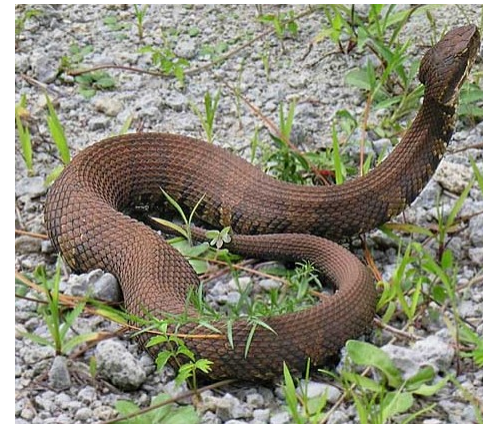
Western Cottonmouth (Potentially Dangerous)